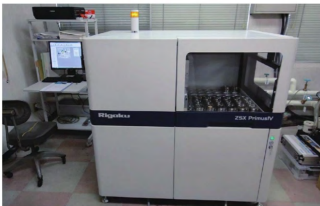
X-ray fluorescence analyzer